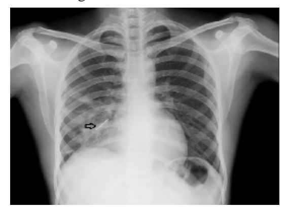
Fig. 1: Radiograph of Chest PA View, Arrow Showing Long Radio-Opaque Foreign Body in Line With Right Lower Lobe Bronchus with Few Consolidatory Changes in the Right Middle Lobe

Chest radiograph (Fig.1) revealed a radio-opaque, long, linear foreign body resembling a nail in the right lower lobe bronchus with patchy consolidation in adjacent right lower zone, in paracardiac region.